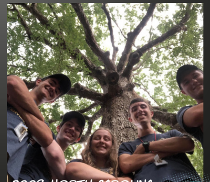
2009, NORTH CAROLINA